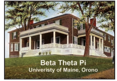
Beta Theta Pi University of Maine, Orono

Thank You to our Building Fund donors, past and present